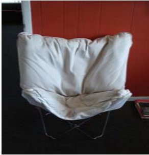
Comfy Chair (2 will be given away)