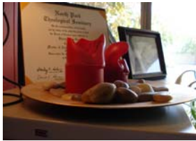
Gold Candle Plate with Rocks (from CLOSER)