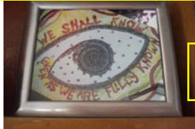
1 Corinthians 13:12 Art piece

All current Jr. and Sr. High Students are eligible to put their name in the drawing at each youth event. Fill out an entry form (located on events board) and put in the locked box on the events board in the youth room.